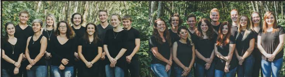
Team C: Living Waters Willoughby & Building 272 in Aldergrove