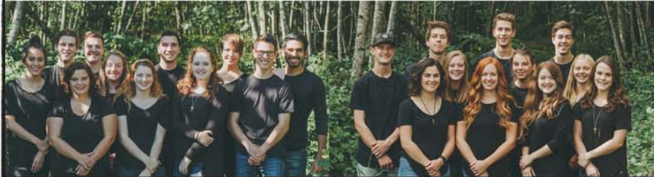
Team A: serving at The Crossing (South Surrey) & Nightshift Street Ministries.

Our Omega 2016-2017 class is an incredibly strong group that God has brought together to achieve our goal of bridging the hand of the community to the hand of the church. Our mission-hearted team of 45 is heading to Poland for nearly a month at the end of April. Our four teams will be spreading across the country with the common goal of strengthening the reputation of the Church within the community and opening doors for further ministry.